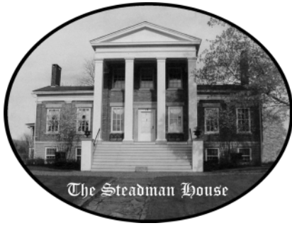
The Steadman House