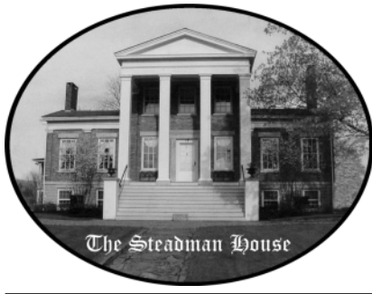
The Steadman House