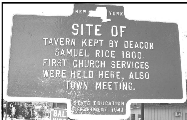
In front of the Catholic Church on Main Street