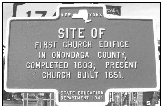
In front of the Presbyterian Church on Main Street