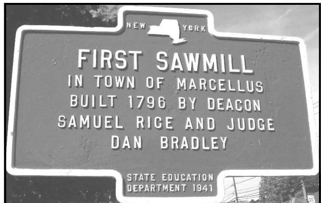
Near the Masonic Temple on Main Street