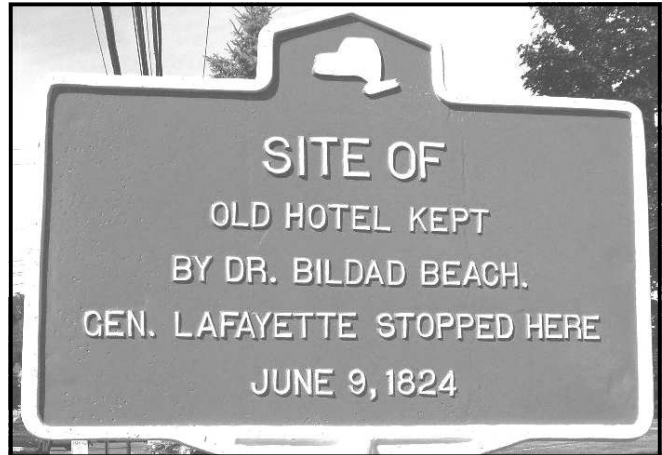
In front of the Alvord House on Main Street