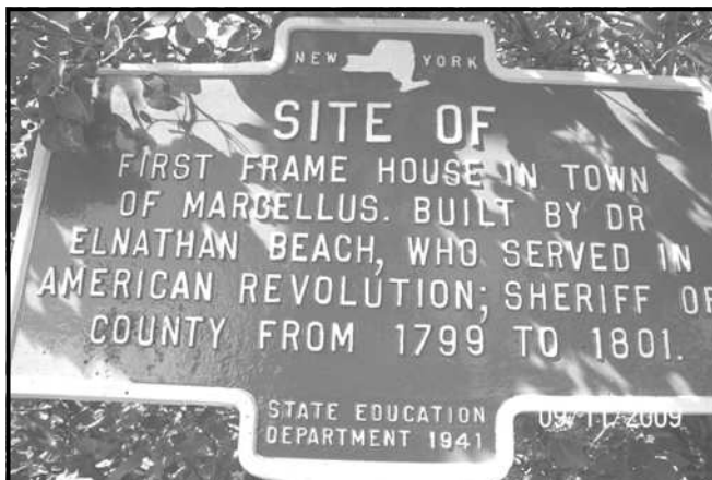
Near Nojaim's on Main Street