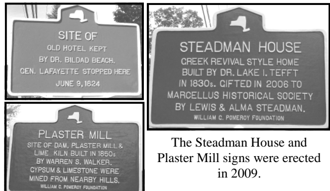
The Steadman House and Plaster Mill signs were erected in 2009.