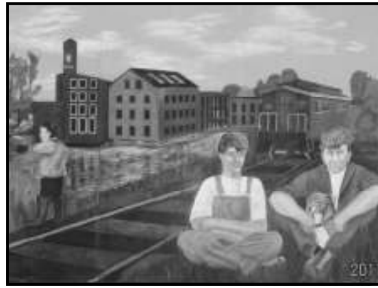
Town Hall Mural