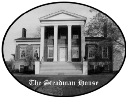
The Steadman House