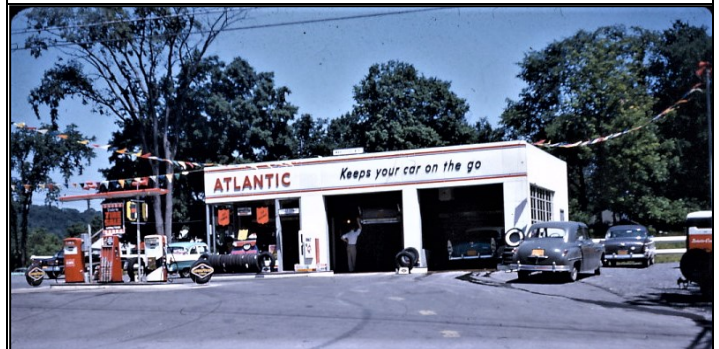
Atlantic station corner of Orange and Main Street. 1950's